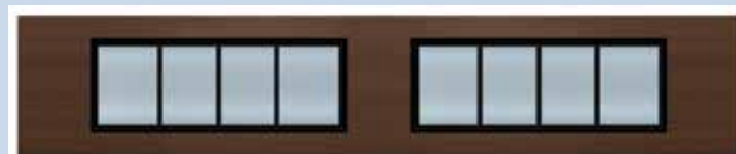
Satin Texture Glass & Provincial Wide Black Muntin Bars

NOTE: Colour representations may not be accurate. Exact colour matches can be requested from a Steel-Craft dealer.