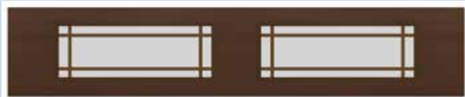
Regal Wide Bronze Muntin Bars