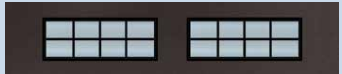
Satin Texture Glass & Stanton Wide Black Muntin Bars