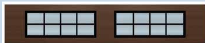
Satin Texture Glass & Stanton Wide Black Muntin Bars