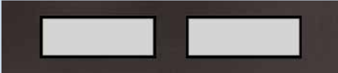
Clear View Sealed Glass