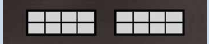
Stanton Wide Black Muntin Bars