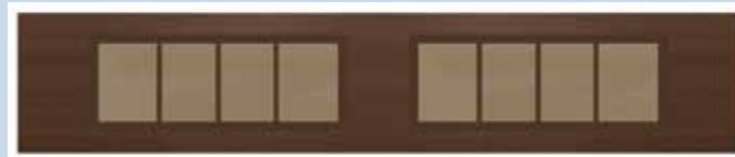
Bronze Tint Glass & Provincial Wide Bronze Muntin Bars