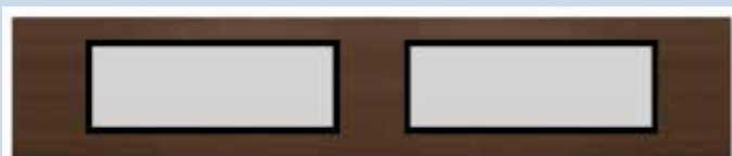
Clear View Sealed Glass