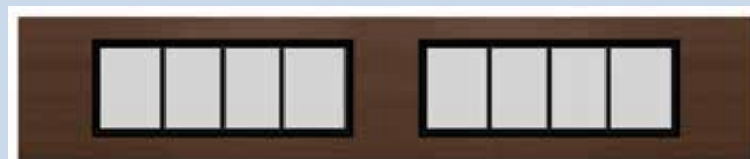
Provincial Wide Black Muntin Bars