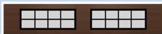
Stanton Wide Black Muntin Bars