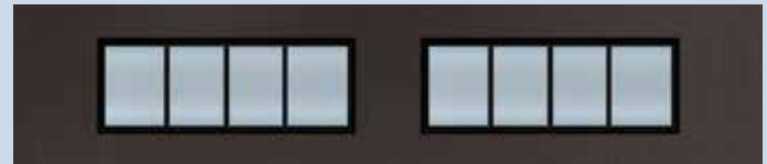
Satin Texture Glass & Provincial Wide Black Muntin Bars

NOTE: Colour representations may not be accurate. Exact colour matches can be requested from a Steel-Craft dealer.