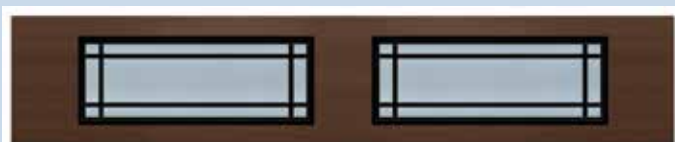
Satin Texture Glass & Regal Wide Black Muntin Bars