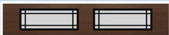
Regal Wide Black Muntin Bars