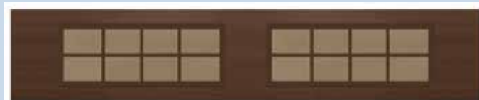
Bronze Tint Glass & Stanton Wide Bronze Muntin Bars