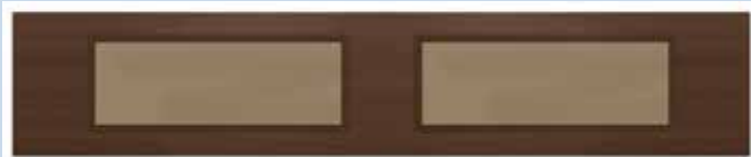
Bronze Tint Sealed Glass