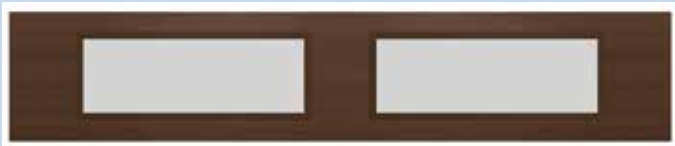
Clear View Sealed Glass