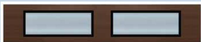
Satin Texture Sealed Glass