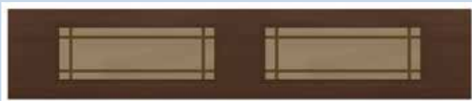
Bronze Tint Glass & Regal Wide Bronze Muntin Bars