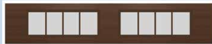
Provincial Wide Bronze Muntin Bars